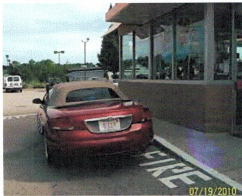
Illegally parked in Fire Lane