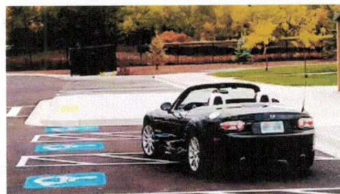
Illegally parked in parking lots