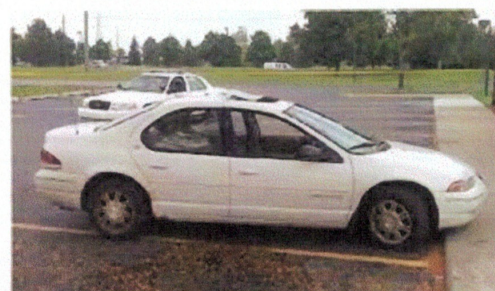
Abandoned and stolen cars removal.